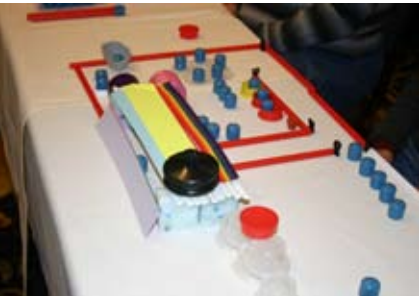
Using recycled and natural open-ended materials with adults and children can help them expand and elaborate on their ideas. As they play, they create new ideas, creations, and stories to share.

During the early childhood years, solitary, parallel, constructive, exploratory, and dramatic play is at the heart of early childhood education. Play experiences are key to children forming early mathematics and literacy skills, as well as social and emotional competence. Yet, in many early care and education programs and throughout society, play is overlooked and undervalued.