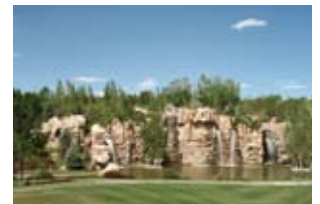
Waterfall in the Thanksgiving Point Gardens.

Throughout the week we heard from each of the other states about their accomplishments, hardships and plans for the future. It wasn't all work though; we also had a day of fabulous R&R. Our options included the local Zoo, visiting the gardens, hiking to the local caverns, shopping and various other adventures. We all look forward to next year, Alaska is hosting in June!