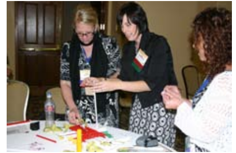
During play workshops, educators play with open-ended materials alone and in groups. As educators work together, they create stories and share ideas for offering play experiences to children.

Send an email to: Sympa@lists.unr.edu In the Subject Line Type: Subscribe nvplaypolicypractice FirstName LastName (Individual receiving messages) OR Subscribe nvplaypolicypractice CenterName (Center receiving messages) Message Area: leave BLANK!