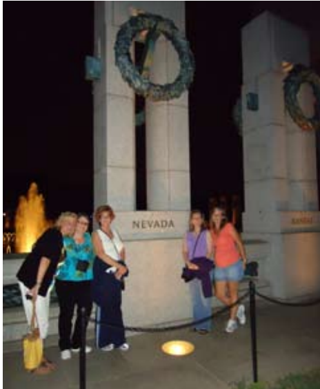
Several NV Early Childhood Advisory Council members participated in the Early Childhood 2010 Summit in Washington DC along with 10 other representatives from across the state to support early childhood systems and collaboration building for children and families in Nevada.