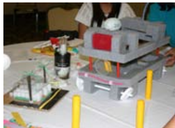
An individual in this workshop created a "double-decker bus." When the participants at this table worked together, they created a story about riding the "double-decker bus" to various locations around Las Vegas.