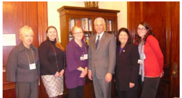
Meeting Senator Ensign

The highlight of the trip was a private tour of the inside AND outside of the Capitol Dome sponsored by Representative Dean Heller where several of the group were treated to a 360 degree view of the entire city on a beautiful winter day. We were lucky to be scheduled to leave DC when we did as what was the storm of the century buried the city in snow for the next two weeks!